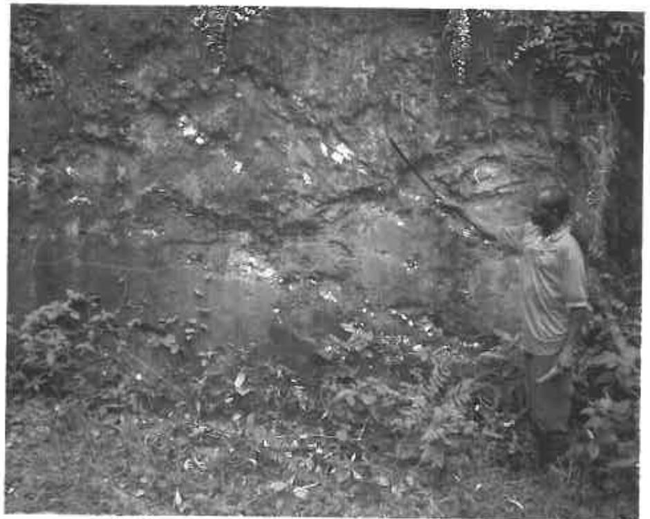
Viking Ashanti hopes to define 1 moz gold at its projects in Ghana by mid-2012