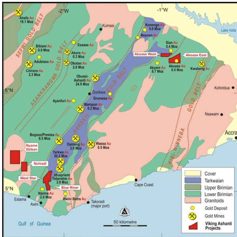
Figure 1: Viking Ashanti Project Locations, Southern Ghana