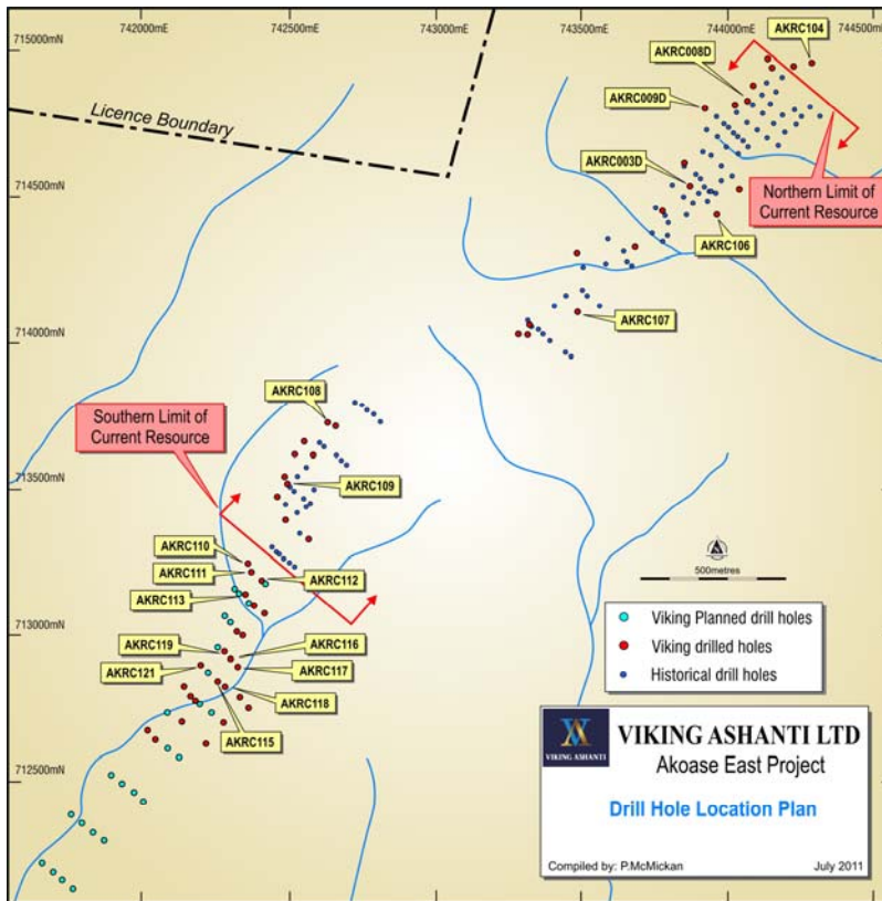
Figure 3: Akoase East Drill Hole Location Plan